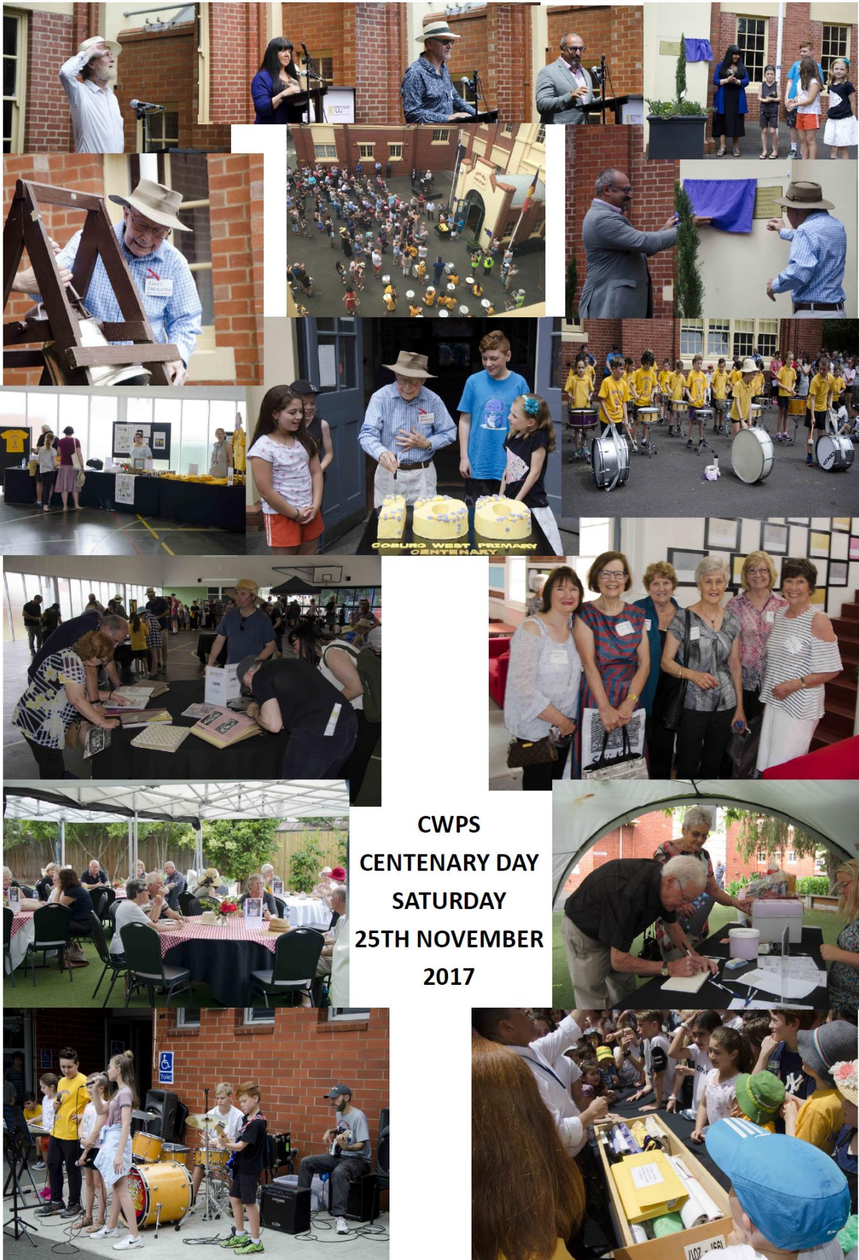
CWPS CENTENARY DAY SATURDAY 25TH NOVEMBER 2017